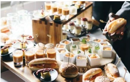
Lunch served in the conference room