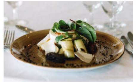
Lunch served at our restaurant or in a banquet room